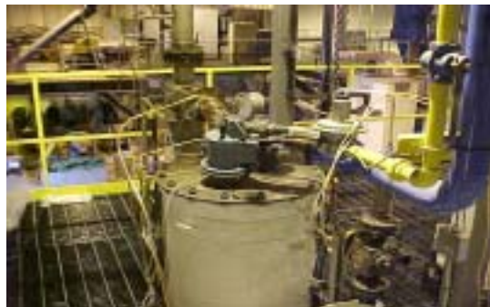
ThermJet Burner mounted on Fluidized Bed