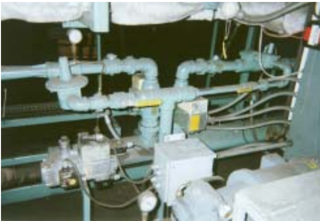
Air and Gas Piping