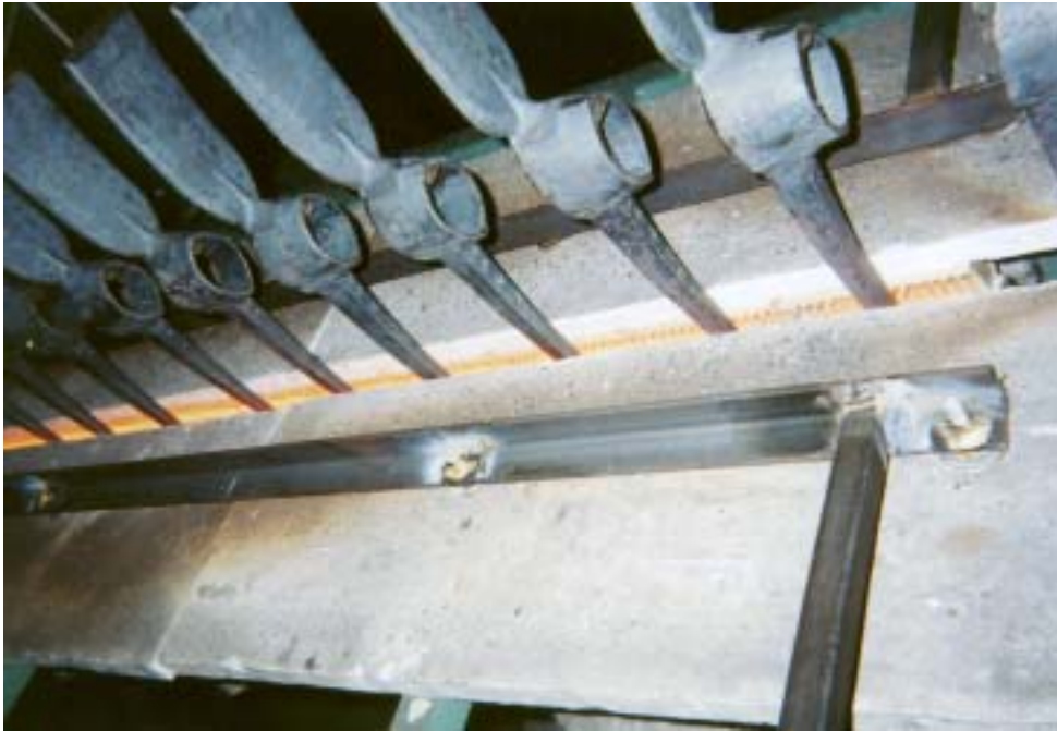
Hardening Process Line