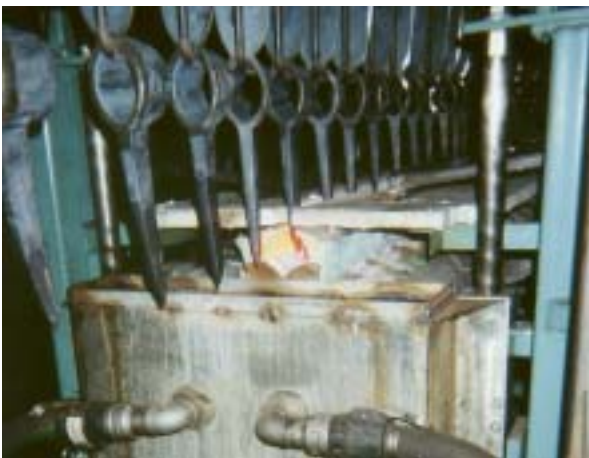
Hardened parts leaving quench tank